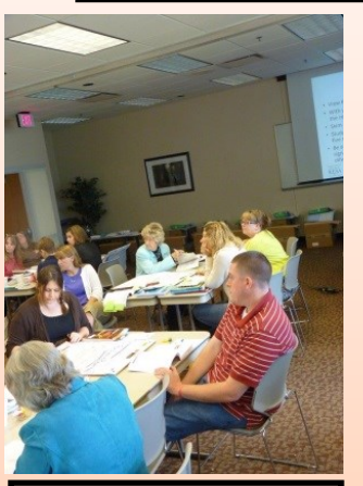
Participants listen to a group reporting out on their learning.