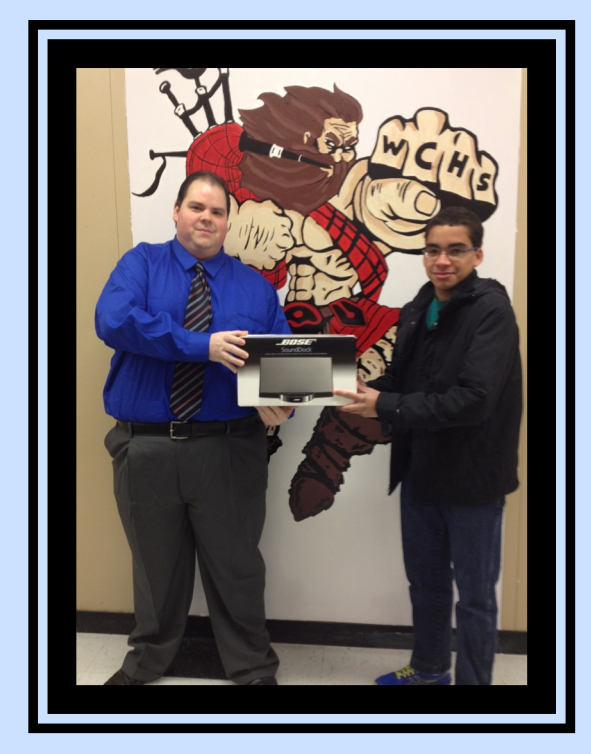
Webster County High School

The final "state" version will be comprised of clips from all who entered and posted to the Office of Healthy Schools website in April. The WVDE's Office of Healthy Schools will also cut a Let's Move! WV Statewide "Call Me Maybe" video to be featured on Let's Move! WV webpage. Schools are now being asked to participate in the spring challenge—the Sid Shuffle from "Ice Age" online video.