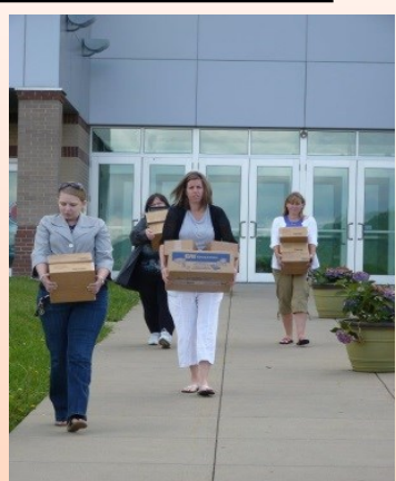
A small group carries some of their gifts to their cars.