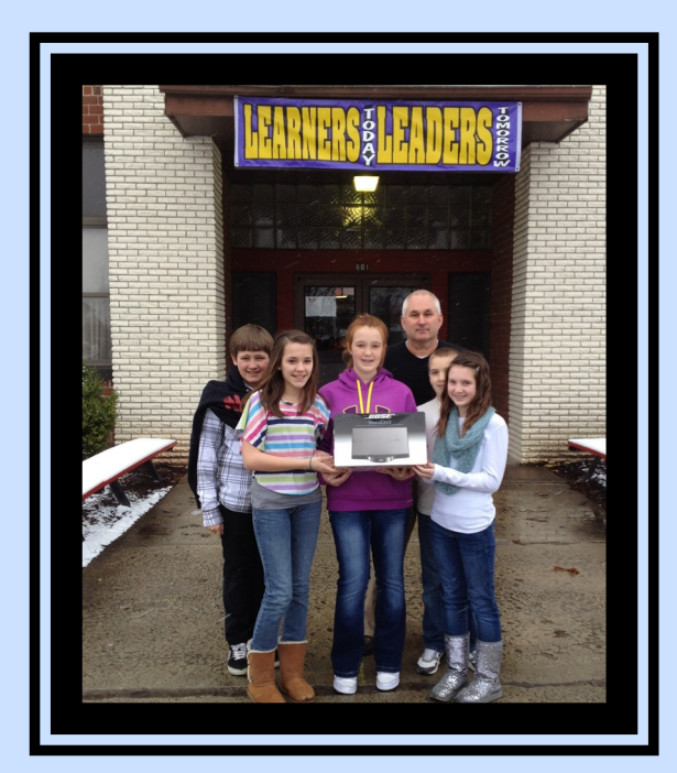
Collins Middle School

Schools that submitted a video were entered into a drawing for either a Bose Sound Dock or, courtesy of American Dairy Mideast/Fuel up to Play 60, an IMotion Sound Dock.